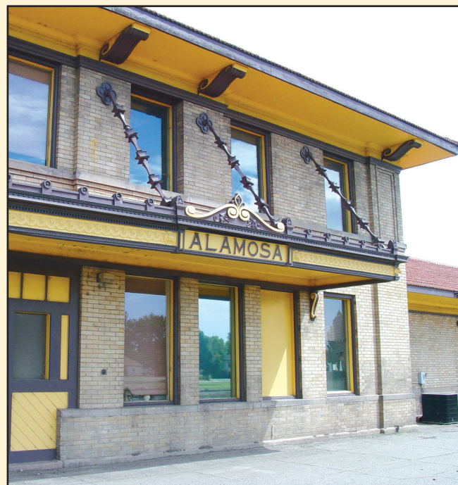
D&RG Railroad Depot (1908-09)

A stroll around Alamosa's downtown reveals its history and small town charm. From red brick to pressed metal ornamentation and glazed colored tile, Alamosa is a study in the architectural trends that have passed through the nation since the 19th century—late Victorian, commercial brick, Mission Revival, and Art Deco styles stand side by side in this tightly constructed area.